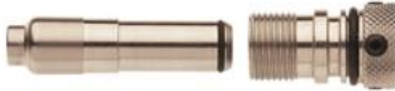
Front retainer and adjustment screws