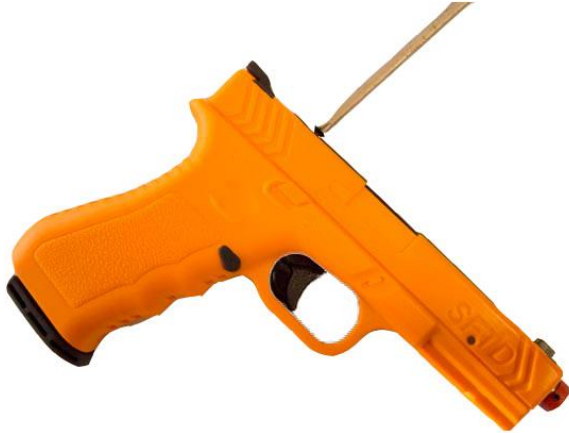
Figure 4: Unscrew top screw