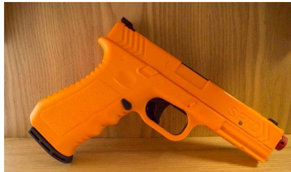
Figure 3: Leaning gun up