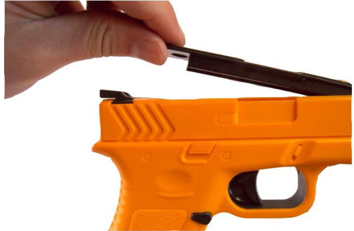
Figure 5: Remove top cover