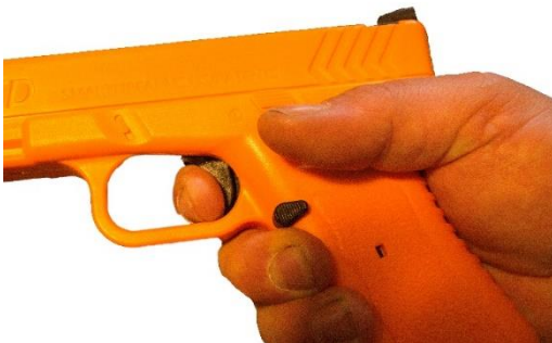
Figure 2: Pulling trigger